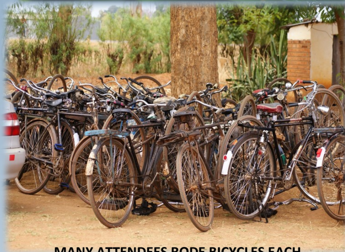
MANY ATTENDEES RODE BICYCLES EACH DAY TO THE SUMMIT.