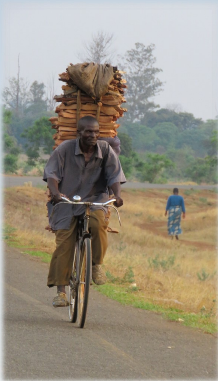
MEN CUT AND STACK FIREWOOD ON THEIR BIKES TO SELL IN THE CITIES, HOPING TO EARN $5 A DAY.