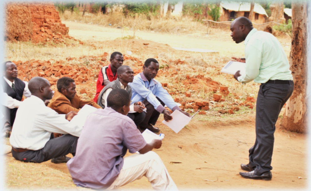
DISCUSSION GROUPS WERE HELD AT THE CLOSE OF MOST SESSIONS TO EXPAND INSIGHT AND DISCUSS APPLICATION.