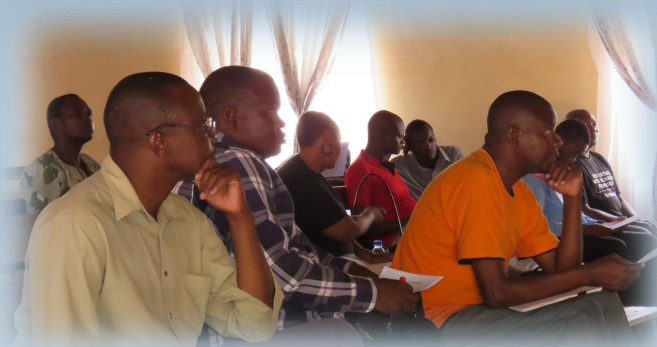
LEADERS AT VICTORIA FALLS DISCUSS CONDUCTING A GREAT COMMISSION SUMMIT.

Every time a person gazes upon Victoria Falls, a rainbow dances on the mist as a reminder of God’s faithful love. God provided Noah’s ark to save mankind from extinction. Although God promised to never again judge the world by water, He will judge it by fire (II Peter 3). And the only ark of safety is the salvation that is found at the cross of Jesus Christ.