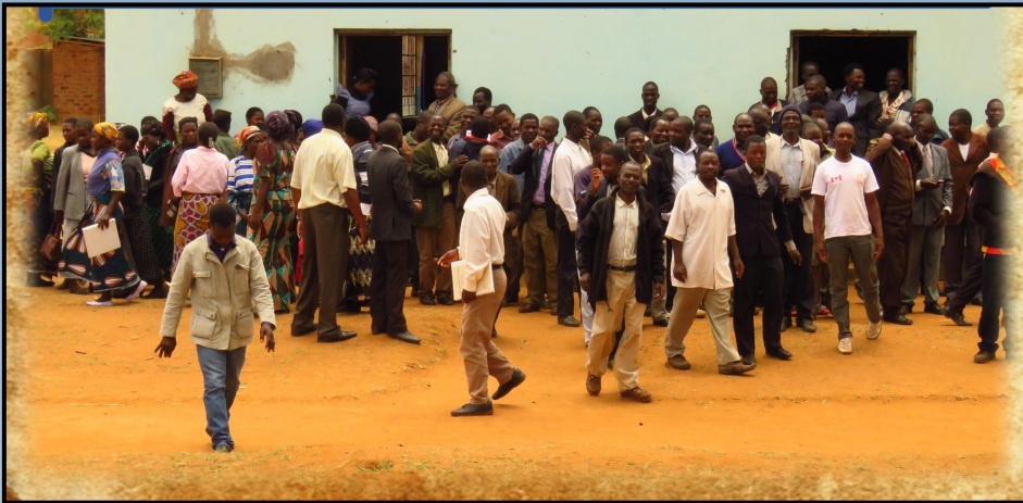
OVER 160 ATTENDEES TRAINED FOR EVANGELISM.