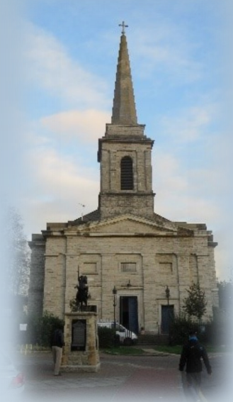
ONCE A MAIDSTONE CHURCH, NOW A COMMUNITY CENTER.

Happily, the response to the summit proved the concern about failure to be unfounded. The leaders insisted that the UK must be brought back to the pure and simple Gospel and refocus on the Great Commission. The leaders want to begin preparing for a much larger summit than the 45 who attended this one. They want to see hundreds meet for a week of specialized training, and they want it now! They see the summit truths as the UK's only hope.