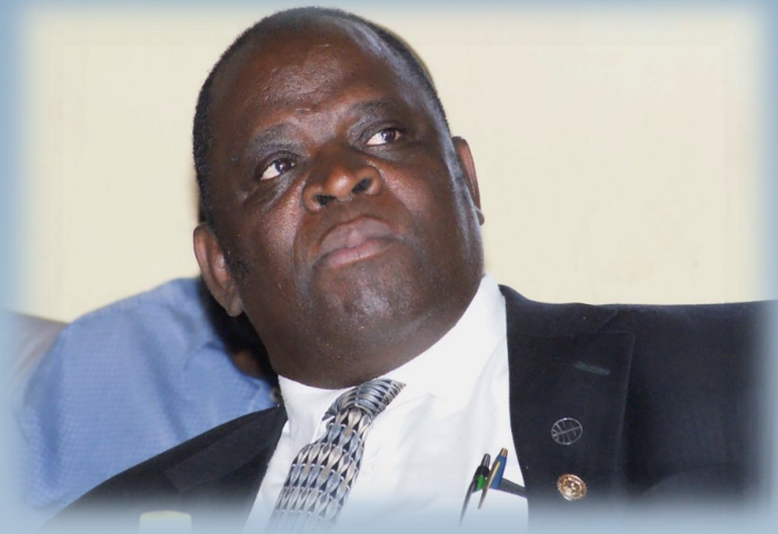
BISHOP THUMA HAMUKANG'ANDU ZAMBIAN BRETHREN IN CHRIST CHURCH IS WORKING TOWARDS REACHING THE ENTIRE NATION WITH THE SUMMIT.